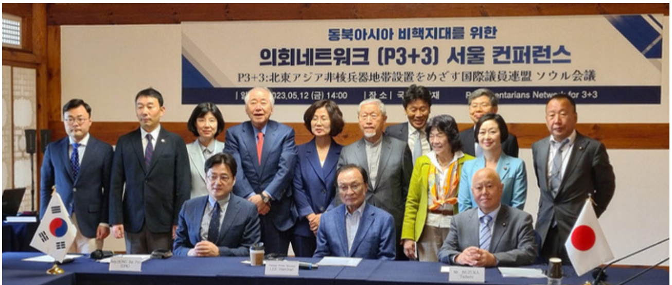
Image: South Korean and Japanese Parliamentarians at a convening to discuss Coalition 3+3 on 12 May 2023

WFM has established a coalition of experts and policymakers to advance a North-East Asian Nuclear-Weapon-Free Zone as a common security framework to lower the risk of nuclear war and achieve regional nuclear disarmament. The 3+3 model would include commitments by Japan, South Korea and North Korea to relinquish nuclear weapons and nuclear deterrence policies in return for legally binding assurances from China, Russia and the USA not to threaten or use nuclear weapons against them.